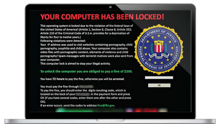
Fig 1. Reveton ransomware taking over an endpoint, with removal instructions

Less sophisticated malware simply locks the user out of the system, preventing them from logging in and accessing programs and data on their device. More advanced forms of ransomware will target specific data files such as sensitive documents, spreadsheets, PDF files, pictures and videos. These files are encrypted with advanced cryptographic techniques so that they become inaccessible for use. This more advanced mechanism may also traverse network shares and hold hostage data files that are present on shared drives and online file storage/sharing services. The malware will also use very long encryption keys making it virtually impossible for the user to circumvent the extortion demands. In either case, once infected, a computer or the data files cannot be used without the decryption key. In many cases, even when the ransom has been paid the ransomware will remain, lying dormant on the hard drive which makes this threat even more concerning.