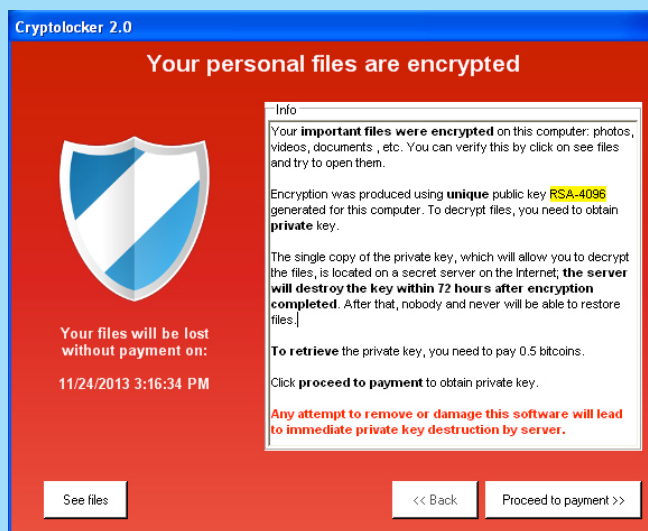
Fig 2. Cryptolocker is more sophisticated ransomware that selectively encrypts data files

To decrypt the files and allow the victim to recover from an attack, these tools require payment using either cash cards or BitCoin. The threat actors mostly operate out of TOR websites in an effort to obfuscate their identities. Payments typically range from $200 to $500, although it is not uncommon for the extortion scheme to run into tens of thousands of dollars per victim. Once paid, a decryption key may be sent which is used to recover the locked system or files – although as can be expected in a criminal enterprise, this is not guaranteed.